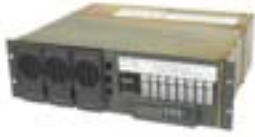
DC Power Systems