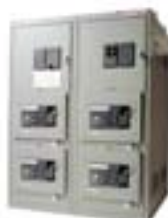
Automatic Transfer Switch

Every facility wants to reduce costs and gain that competitive edge. However, it's difficult when dealing with utility penalties, excessive equipment operation, and a high kVA demand. By installing power factor correction products, you can reduce total kVA demand, resulting in off-loading transformers, switchgear, and other equipment. The reduced total kVA demand translates in lower energy bills, cooler equipment operation, and longer equipment life.