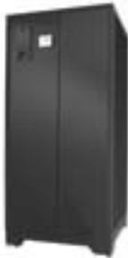
Static Transfer Switch

The PF2, a battery-free DC energy storage technology, is an integrated motor-generator-flywheel that stores kinetic energy in a constantly spinning, quiet, low-friction steel disc. Compared to traditional battery systems, the PF2 dramatically reduces space requirements, temperature restrictions, replacement cycles, and maintenance cost while improving UPS reliability and operational integrity.