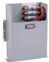
Power Factor Correction

Power surges are among the most common power quality issues facing facilities today - resulting in safety concerns, equipment damage, costly downtime and decreased productivity. For effective surge protection, the IEEE also recommends a cascaded approach, applying surge protection at the service entrance, downstream panels, and point of use for critical loads. Surge protection systems are available to meet these application needs, including a full offering of dataline protection.