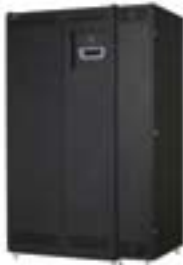
Power Distribution Unit

The Powerware STS is a high-speed switch that can transfer electrical loads from one AC power source to another in a fraction of a single electrical cycle. The Powerware STS eliminates the chance of a loss of power to critical loads by properly coordinating with the electrical distribution system. During a fault condition, the STS continues to conduct current, allowing downstream circuit breakers to work selectively.