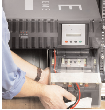
Clear coat battery packaging with thru-holes for diagnostics and testing