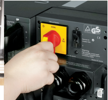
Hot-swappable I/O Box