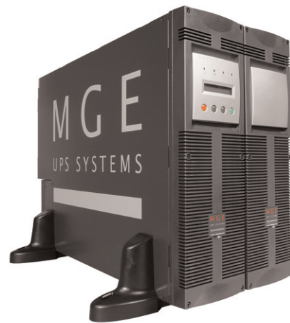
Versatile form factor