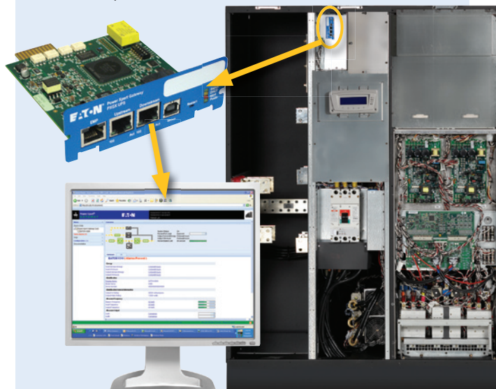
Eaton 9395 550 kVA